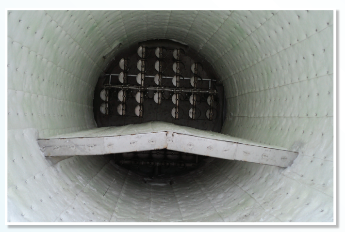
Enclosed flare with an offset wall

1375 COUNTY ROAD 8690 • WEST PLAINS, MO 65775 Phone: (417) 256-2002 - Fax: (417) 256-2801 www.PerennialEnergy.com